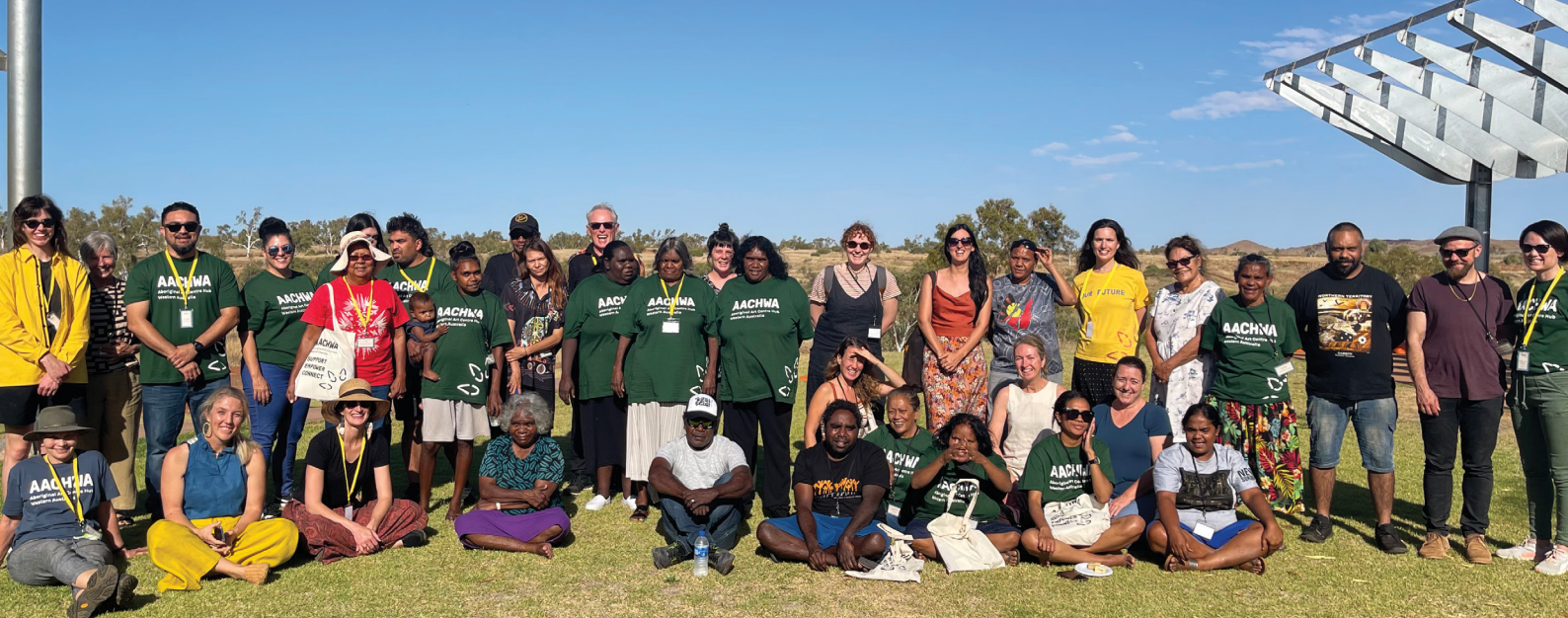
Image: Participants in Our Business: Aboriginal Art Centre Forum, Ngurin Centre, October 2021.