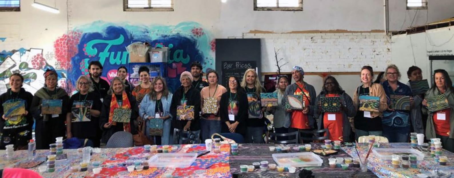
Image: Our Business: Aboriginal Art Centre Forum delegates enjoy an art workshop at Yamaji Art, Jambinu (Geraldton), 2022.