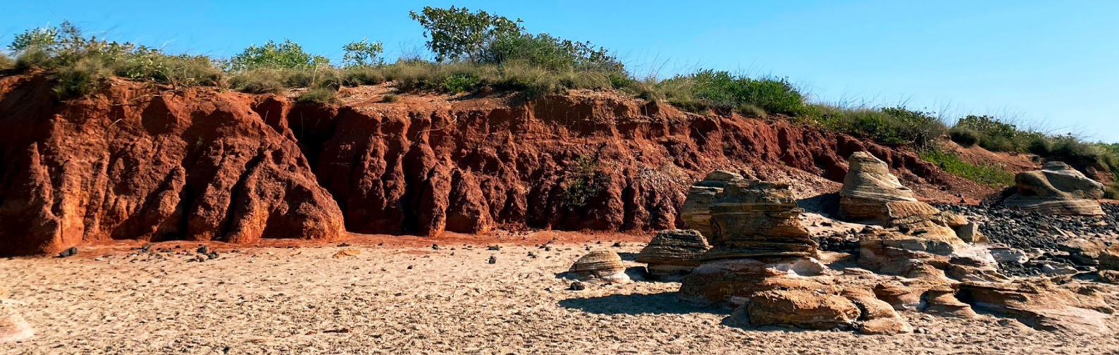
Image: Smoking ceremony with Hayden Woodley, Ganalili Centre, Roebourne, 2021.